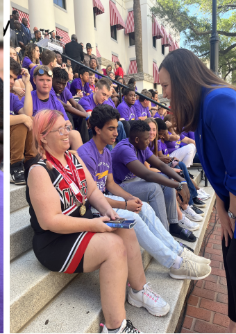
Law Enforcement Torch