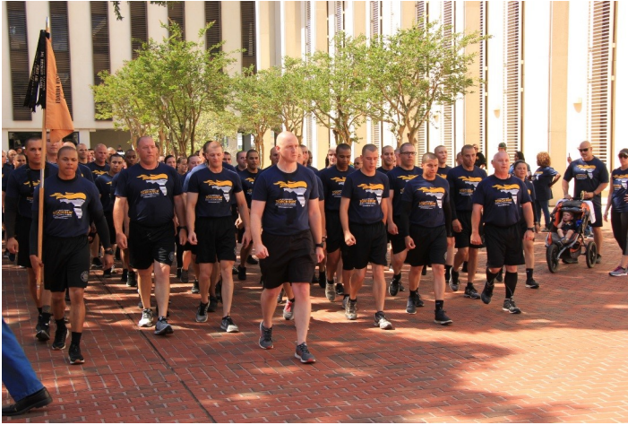
PHOTO RELEASE: Attorney General Moody Kicks Off 2019 Law Enforcement Torch Run