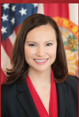
Attorney General Ashley Moody